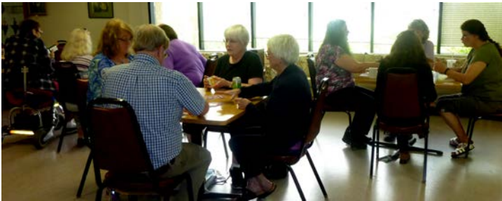
Wednesday Afternoon Bridge Group

Make sure you stay in touch. Having a set time to meet on a regular basis helps. Have you thought of starting a group but didn't know where to meet? The Senior Center is a great place for your activities. It's bright and sunny. It's roomy and convenient. We can reserve a private time. A book club, game club, sewing, knitting or quilting groups would be a few ideas – there's even a piano if you want to have a music session! Call and let's see what we can arrange! 463-6175.